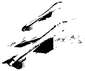
The Other Side of the Mountain Gang