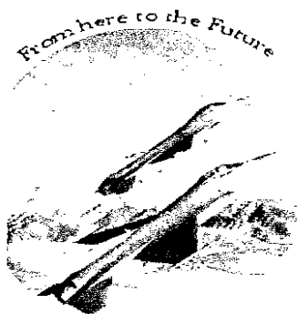
The Other Side of the Mountain Gang