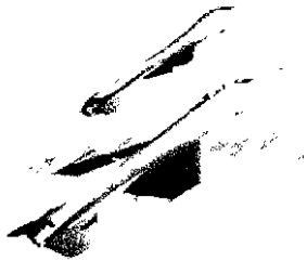
The Other Side of the Mountain Gang