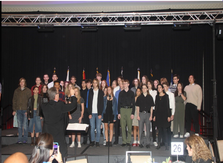
VETERAN'S SALUTE, HYATT REGENCY NOVEMBER 3, 2022